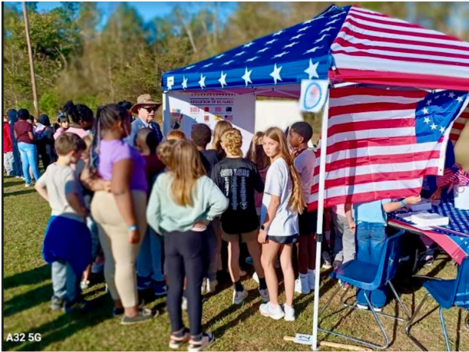
October 23 was American Revolutionary War Living History Day at JET Middle School. It lasted from 9:00